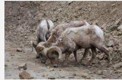
This image illustrates animals' salt-seeking behavior, as three male bighorn sheep discover a natural salt lick along Guanella Pass, a few miles south of Georgetown, Colorado.

The study was published in the Proceedings of the National Academy of Sciences early edition online on July 11.